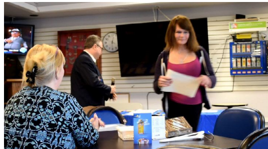
Karaoke Lady .....p 2