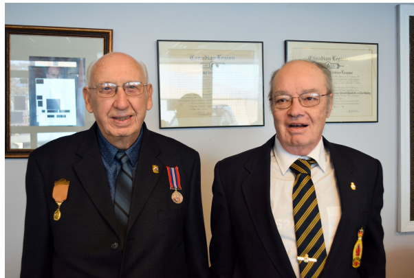
Long serving members together

The following photos are mostly of members receiving a CERTIFICATE OF APPRECIATION: